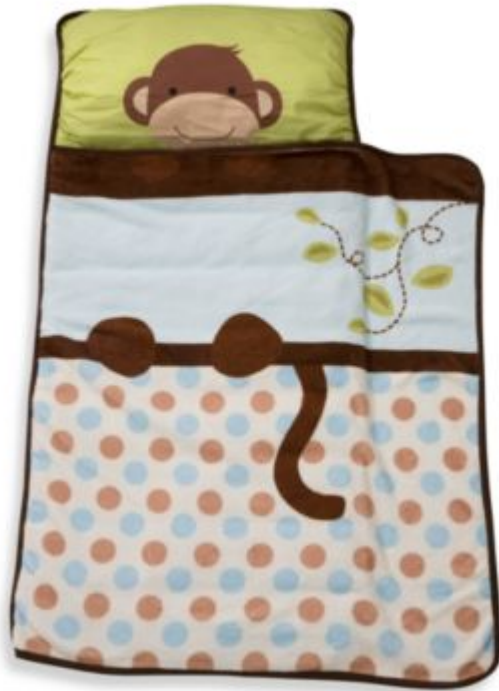
Picture of a napmat